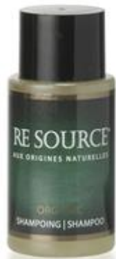
Shampoo 30 ml

A full range of hair and body care products in traditional single use bottles or refillable 300ml dispensers