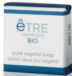
Pure Vegetable Soap 30 gr