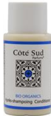
Hair Conditioner 30 ml