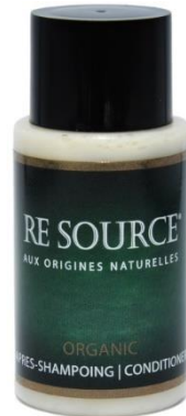
Hair Conditioner 30 ml