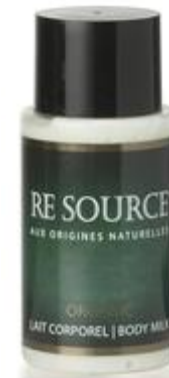
Body Milk 30 ml