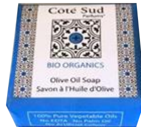
Pure Vegetable Soap with Olive Oil 30 gr