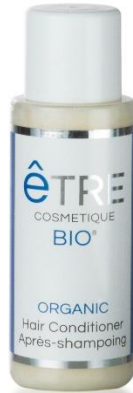
Hair Conditioner 30 ml