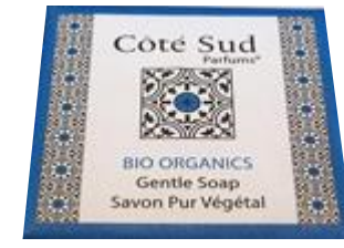
Pure Vegetable Soap ECOLABEL 20 gr