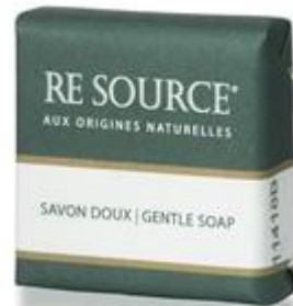
Pure Vegetable Soap 30 gr