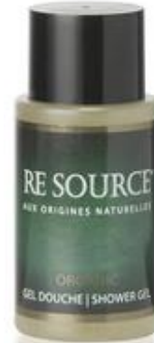
Shower Gel 30 ml