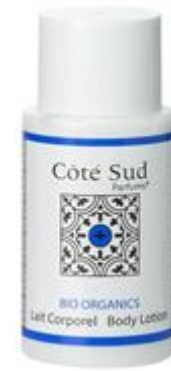
Body Lotion 30 ml