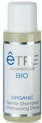
Gentle Shampoo 30 ml

A full range of hair and body care products in traditional single use bottles or refillable 300ml dispensers