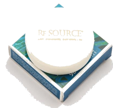
Solid Shampoo 3in1 30 gr