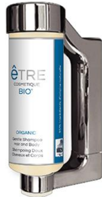
Press & Wash Wall Support