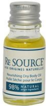
Nourishing Dry Oil for the Body 10 ml