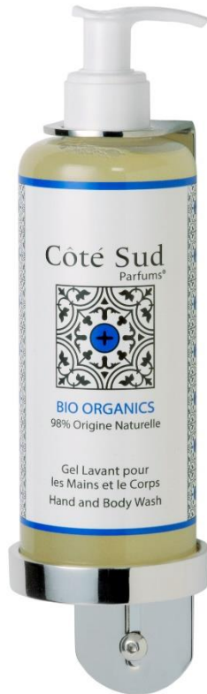
Wall Support for Pump Bottle