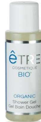
Shower Gel 30 ml