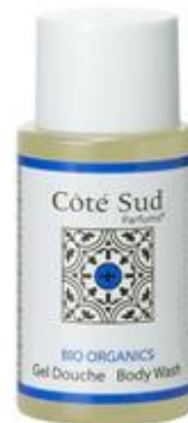
Body Wash 30 ml