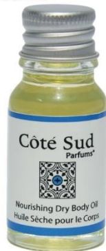
Nourishing Dry Oil for the Body 10 ml