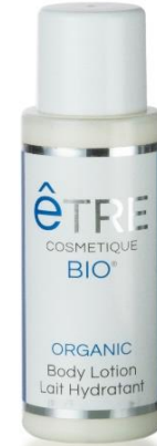
Body Lotion 30 ml