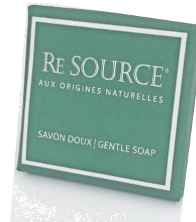
Pure Vegetable Soap ECOLABEL 20 gr