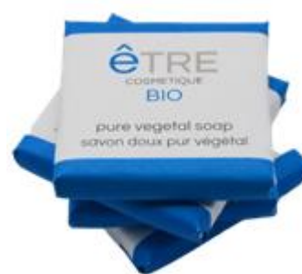
Pure Vegetable Soap 20 gr