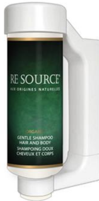
Press & Wash Wall Support