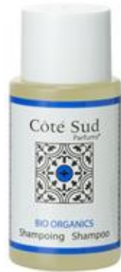
Shampoo 30 ml

A full range of hair and body care products in traditional single use bottles or refillable 300ml dispensers