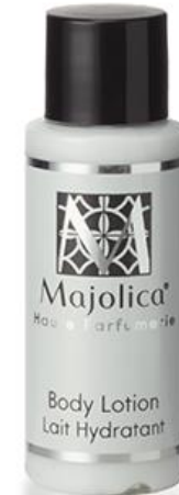
Body Lotion 30 ml