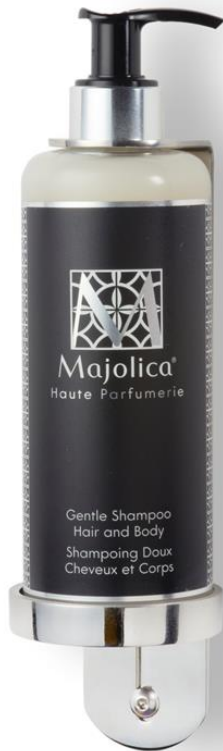
Wall Support for Pump Bottle