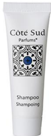
Shampoo 60 ml