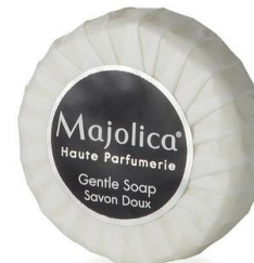
Gentle Soap paper wrap 25 gr