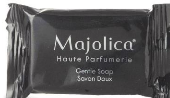
Gentle Soap flow pack 20 gr