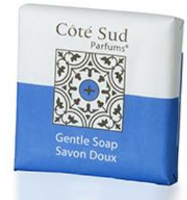
Soap 20 ml paper wrap