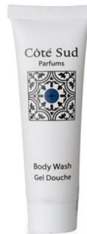
Body Wash 60 ml