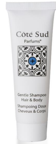
Shampoo Hair & Body 60 ml