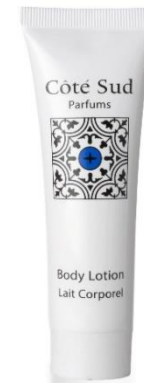
Body Lotion 35 ml