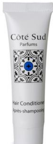
Hair Conditioner 60 ml