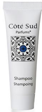
Shampoo 35 ml

A full range of hair and body care products in traditional single use tubes or refillable 300ml dispensers