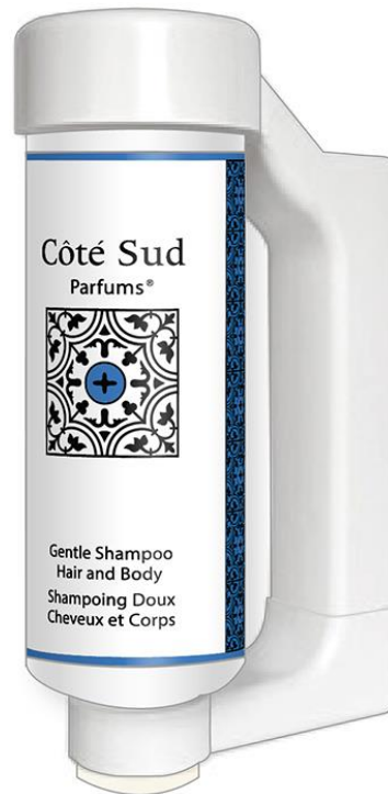
Press & Wash Wall Support