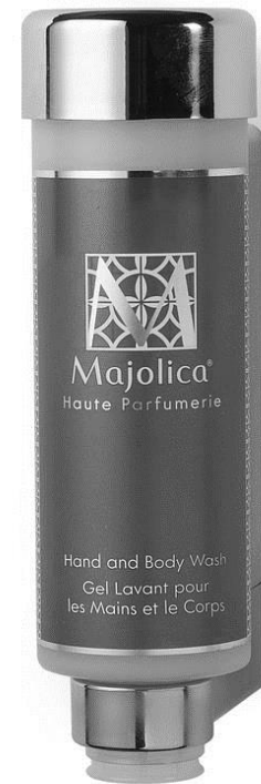
Press & Wash Wall Support