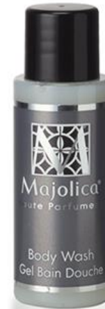
Body Wash 30 ml