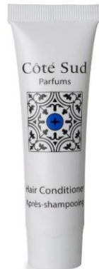
Hair Conditioner 35 ml