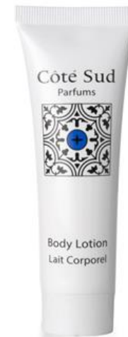
Body Lotion 60 ml