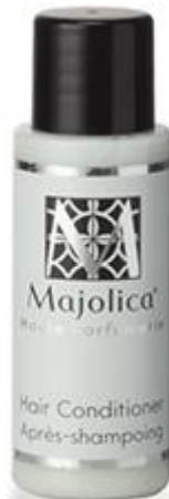
Hair Conditioner 30 ml