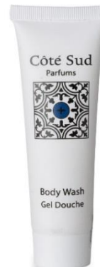
Body Wash 35 ml