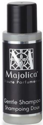
Shampoo 30 ml

A full range of hair and body care products in traditional single use bottles or refillable 300ml dispensers